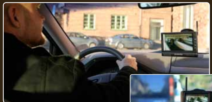
With the clear 3,6" or 7" LCD-monitor in the car cabin you can easily see that your horses are safe in the trailer.