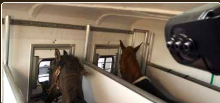
The trailerCam™ wide angle lens covers several horses in the same picture.